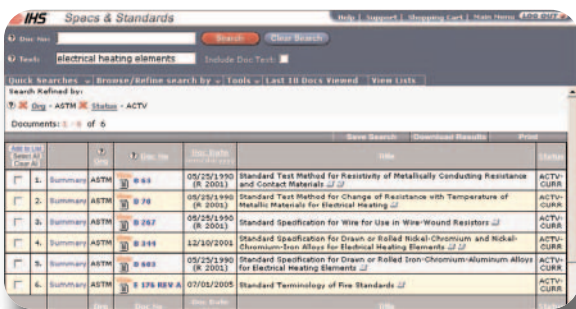
Commercial Standards Search Results

The Commercial Engineering Standards content of IHS Specs & Standards covers International, National, European, U.S., Corporate and Historical Standards, and includes more than 450,000 documents written by over 370 standards developing organizations (SDOs) worldwide. These organizations include: AIA/NAS, ANSI, API, ASQ, ASME, ASTM, BSI, CSA, DIN, EIA (including ECA, JEDEC, GEIA, TIA), GM, IEC, ICEA, IEEE/IEL, IPC, ISA, ISO, NEMA, NFPA, SAE, UL and many more (visit http://engineers.ihs.com/standards/index.jsp for a full listing).