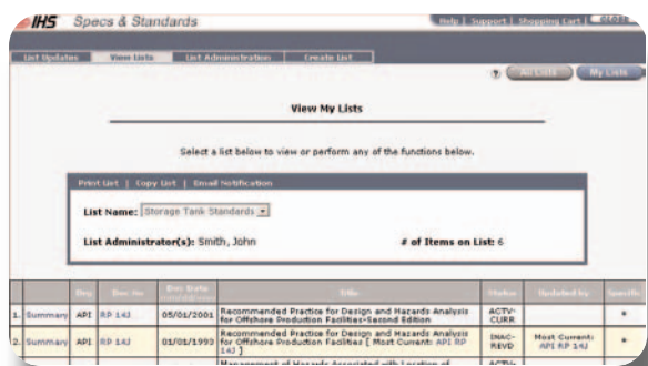
Document List Management Feature